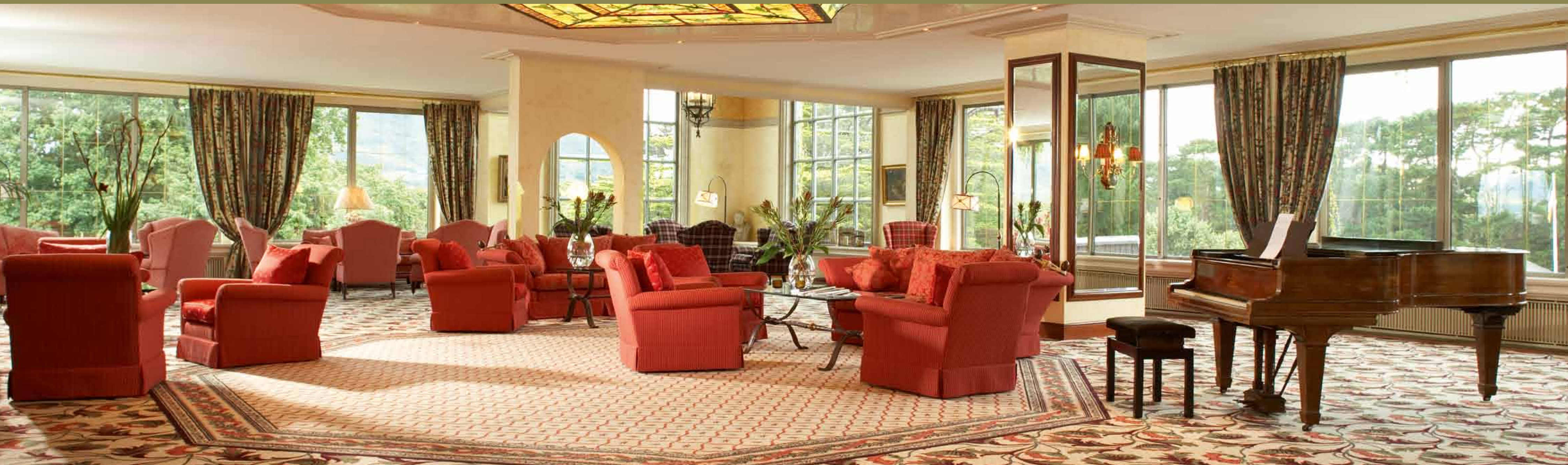
The Upper Lounge – Relax and Unwind in Style