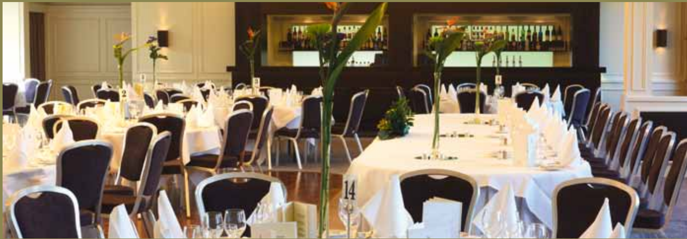
The Park Suite Terrace